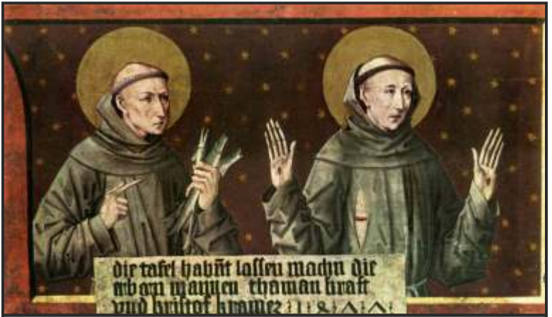
St Anthony of Padua and St Francis of Assisi by Friedrich Pacher