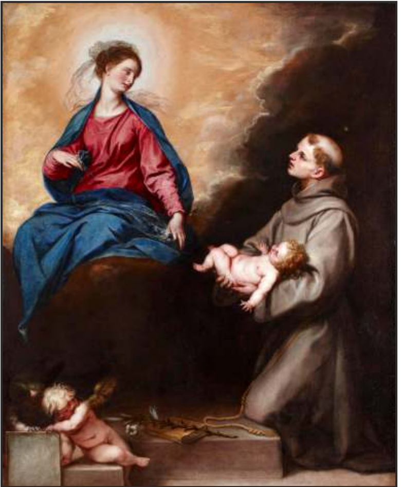
Vision of Saint Anthony, by Alonso Cano