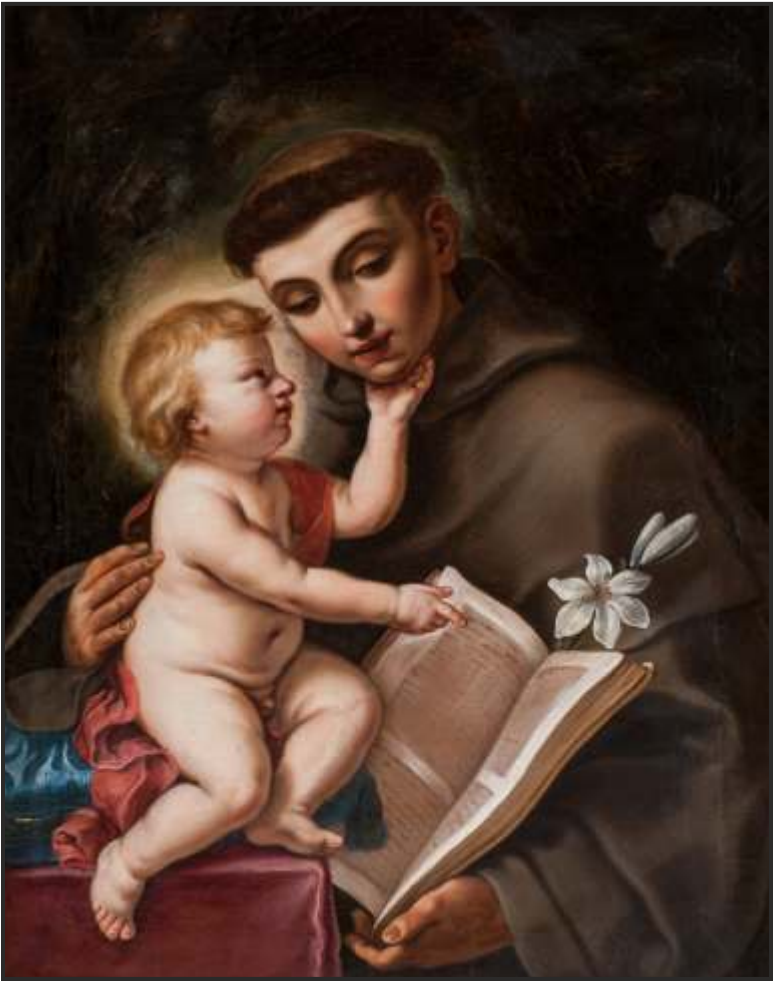
Baby Jesus with St. Anthony of Padua, Elisabetta Sirani, 1656, Bologna, Italy