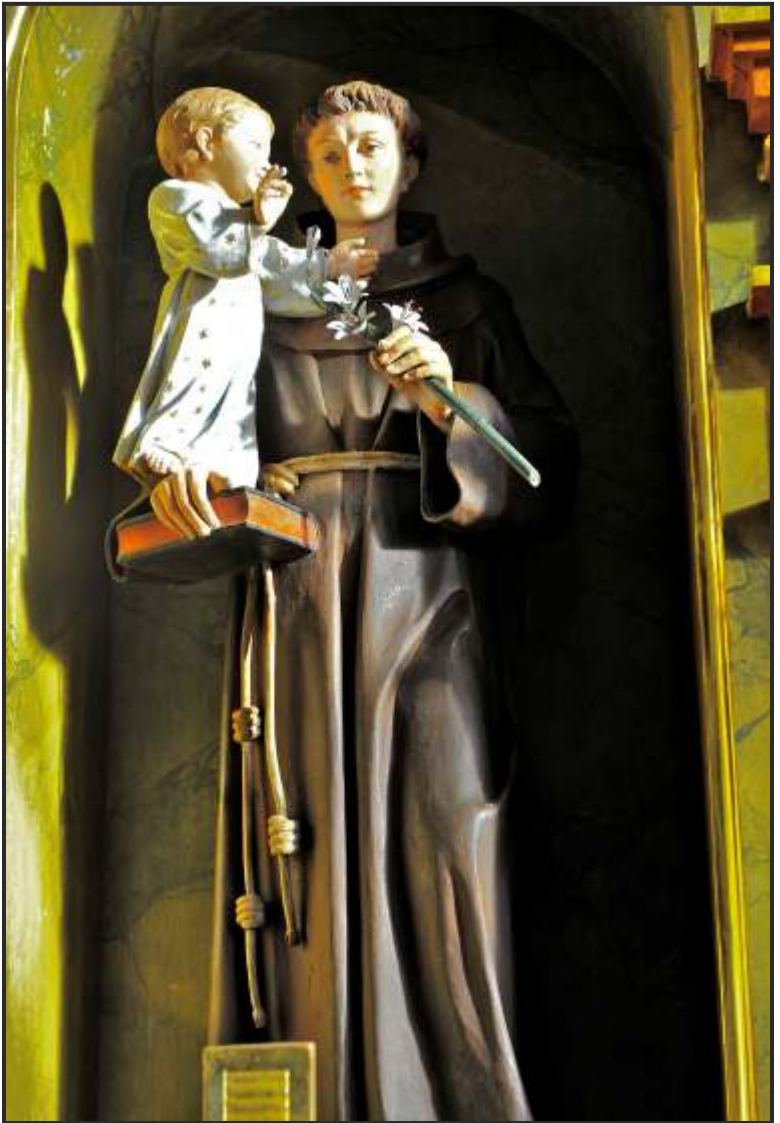
St. Antony with Christ Child, from, Carinthia, in Austria