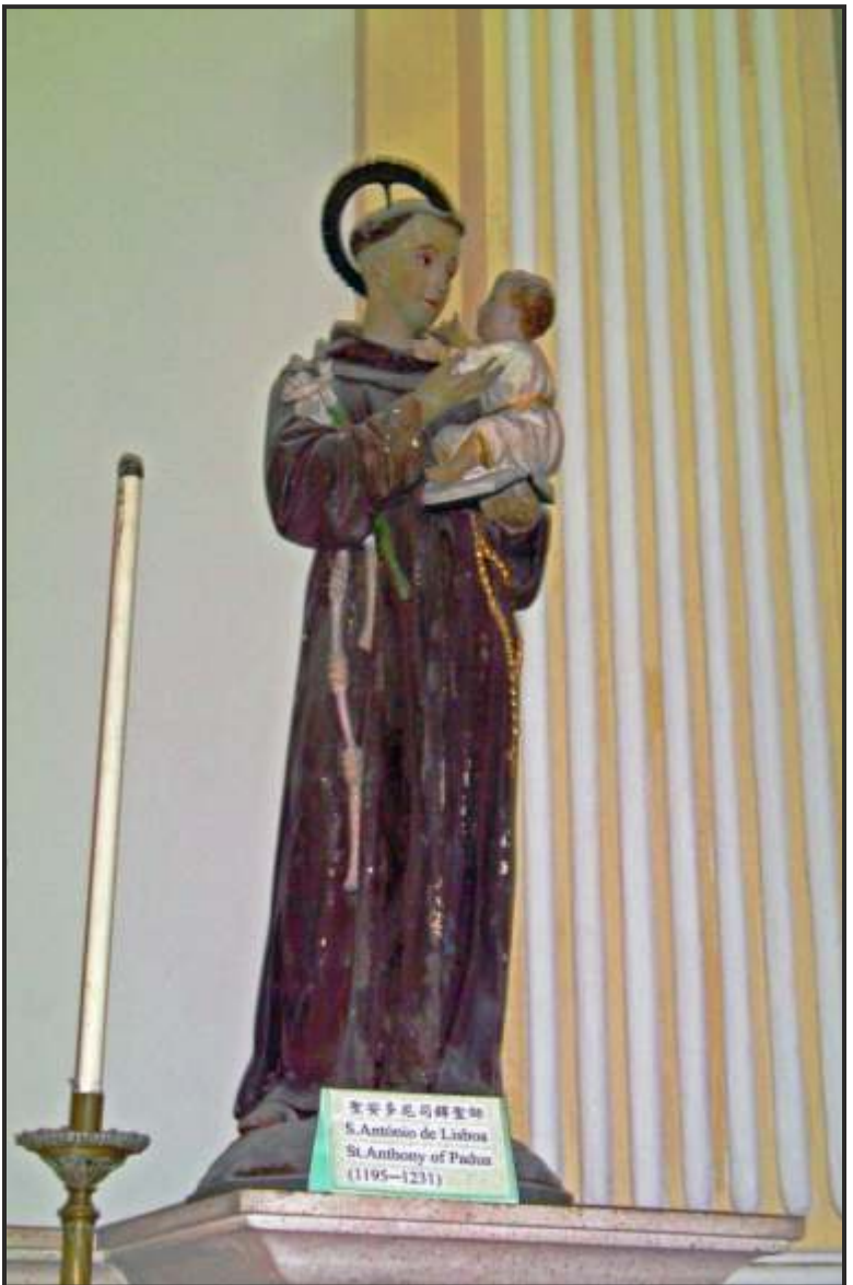
St. Anthony of Padua in St. Joseph's Church, Macao