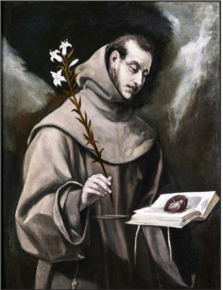
El Greco's painting, 1580, shows the book with an image of the Christ child on the page