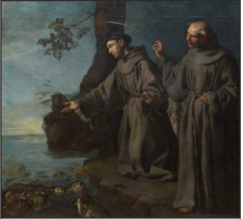
Saint Anthony Preaching to the Fishes, c. 1630