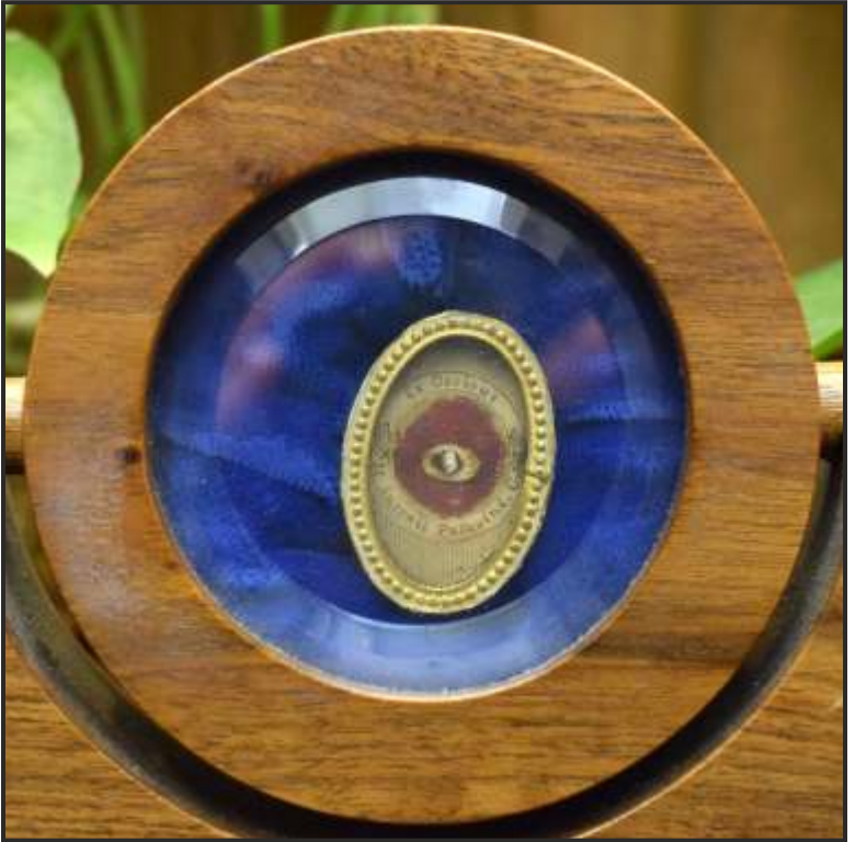
First class relic of Anthony displayed at the National Shrine of St. Anthony of Padua and Friary (Cincinnati, Ohio)