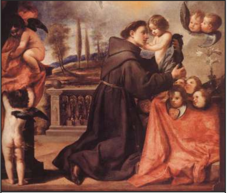
Anthony of Padua with the Infant Jesus by Antonio de Pereda