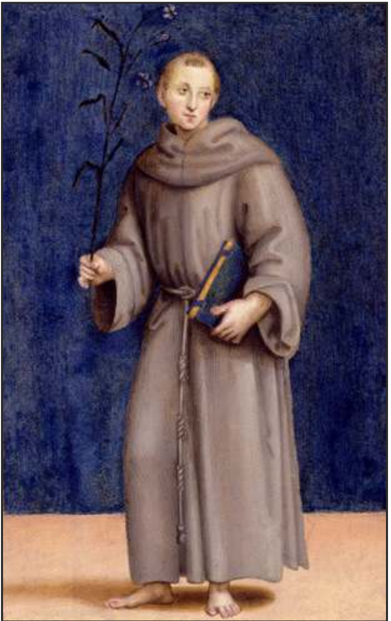
An early work by Raphael, 1503, at the Dulwich Picture Gallery, London, UK