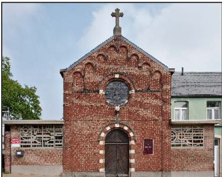
Saint-Antoine de Padoue parish in Wavre, Belgium