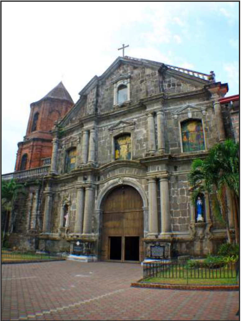
National Shrine of St. Anthony of Padua, Pila, Laguna, Philippines where Franciscans established the first church in the country dedicated to St. Anthony of Padua under the Diocese of San Pablo