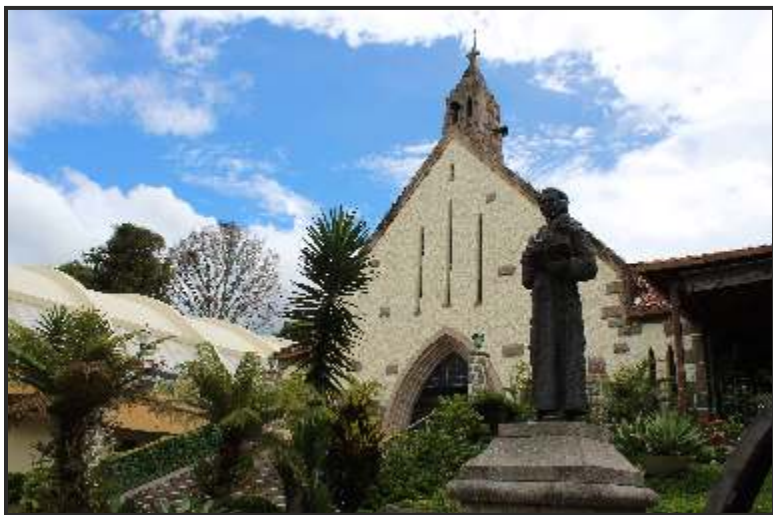
Santo Antônio (Saint Anthony) Church in Teresópolis, Brazil