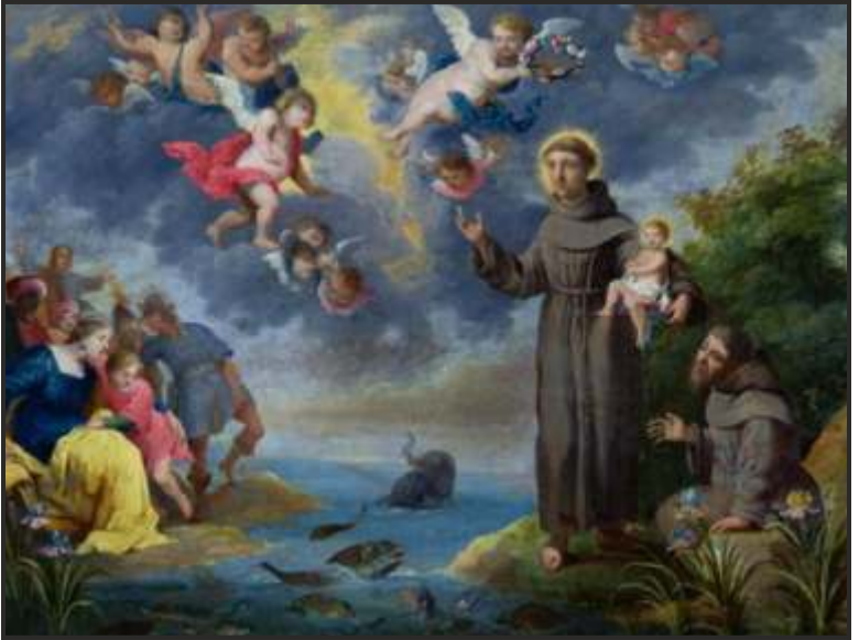
St. Anthony of Padua Preaching to the Fish, by Victor Wolfvoet II.