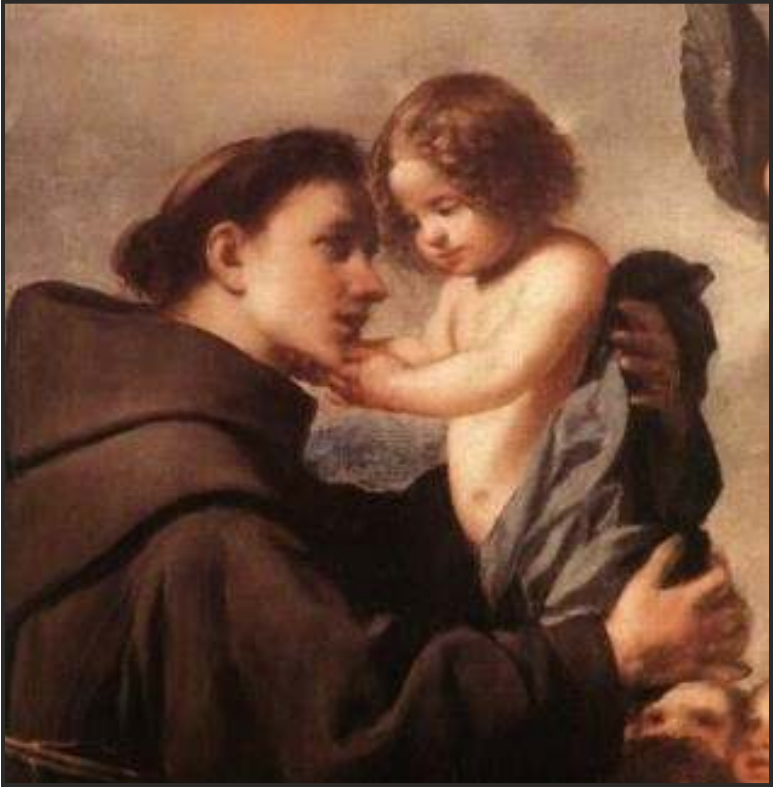
Anthony of Padua with the Infant Jesus by Antonio de Pereda, detail