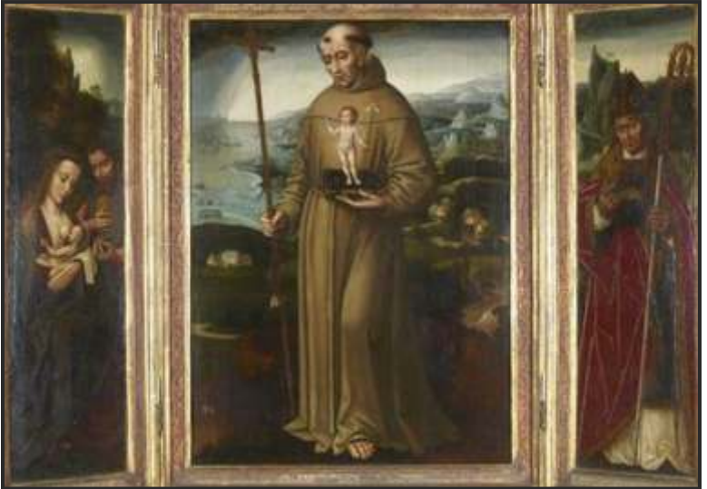
Triptych of Saint Antonius by Ambrosius Benson