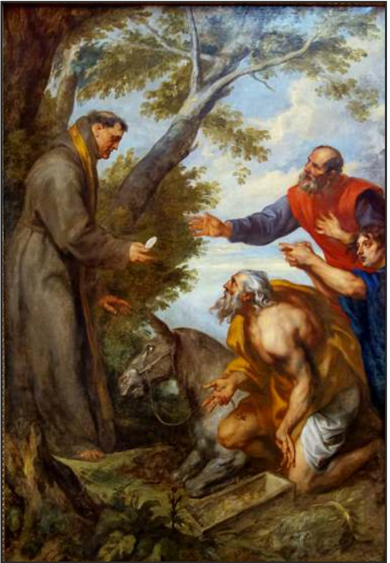
Saint Anthony of Padua and the miracle of the mule, by Anthony van Dyck.