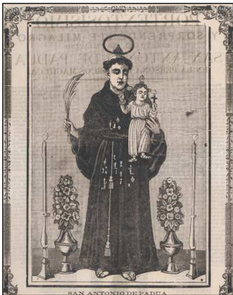
José Guadalupe Posada print of Saint Anthony, about 1910