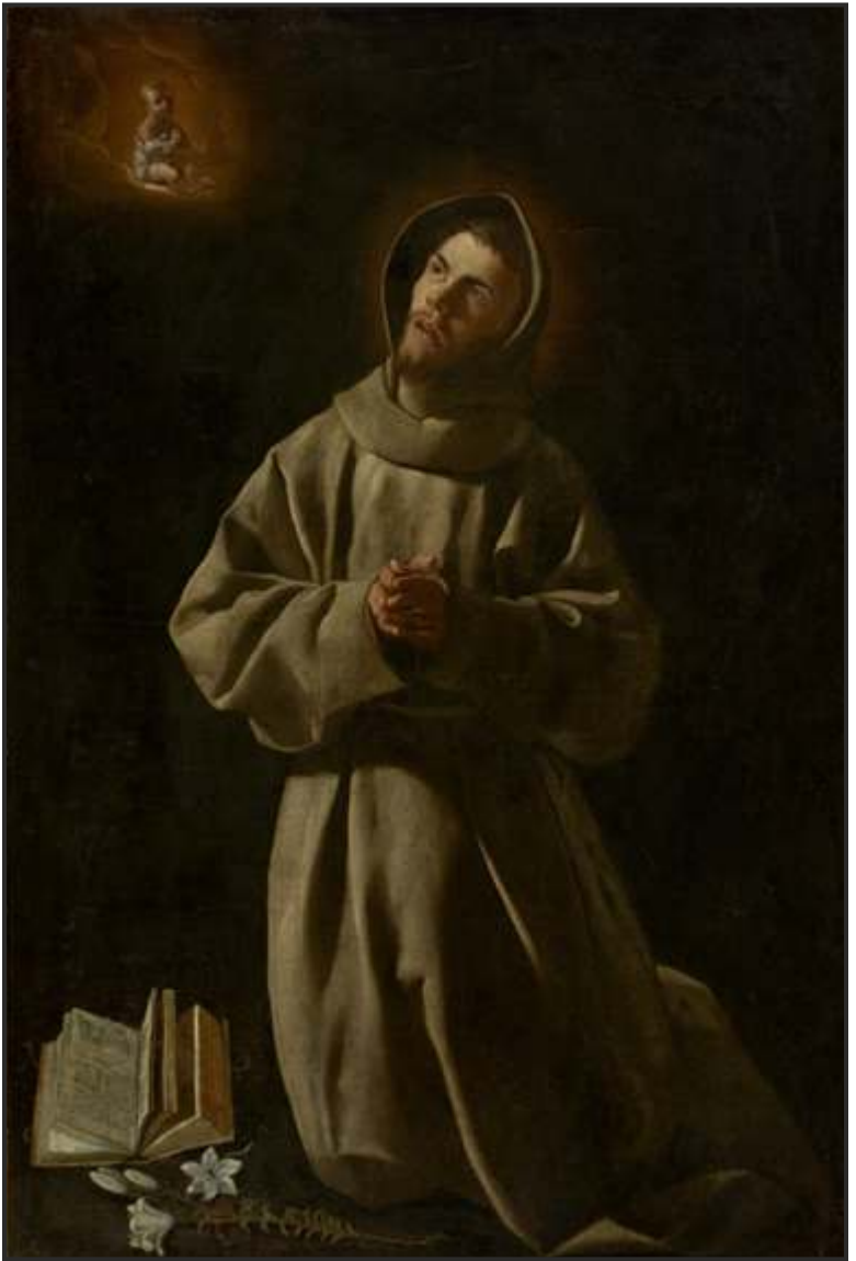
Anthony of Padua by Francisco de Zurbarán, 1627–1630 1