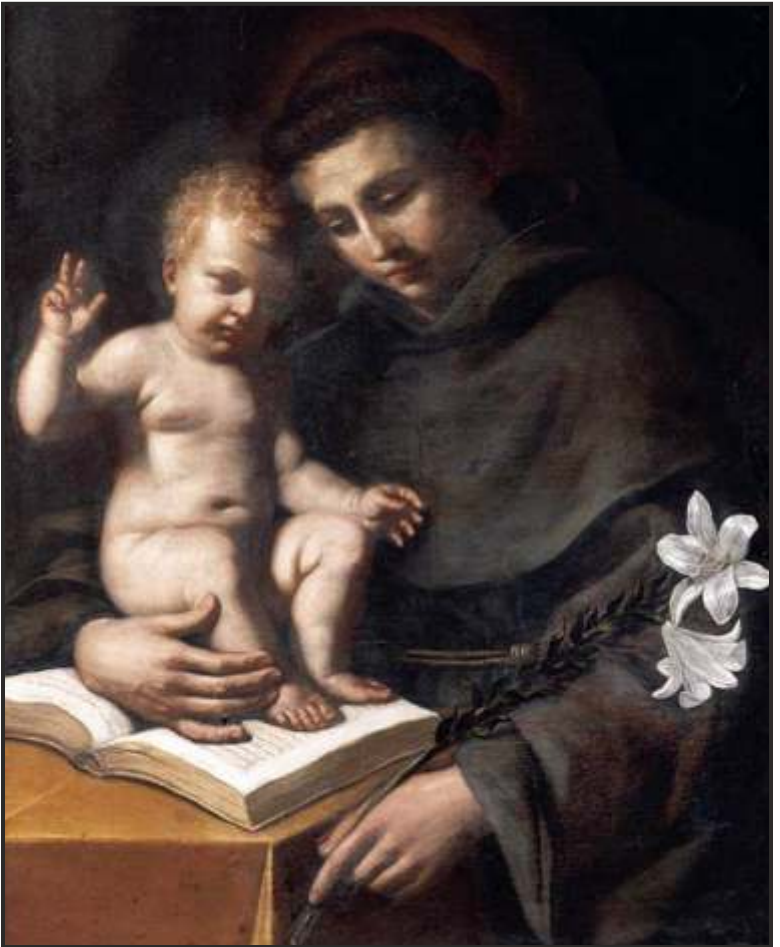
Saint Anthony of Padua with the Infant Christ by Guercino, 1656, Bologna, Italy