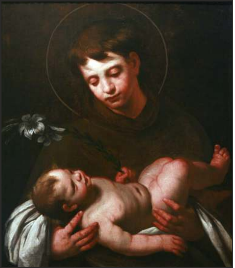
Saint Anthony of Padua holding the Infant Jesus by Strozzi, c. 1625; the white lily represents purity