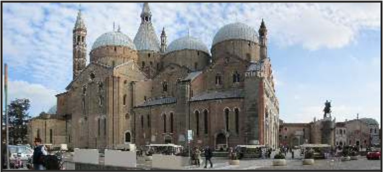
Basilica of Saint Anthony of Padua - Padua, Italy 2